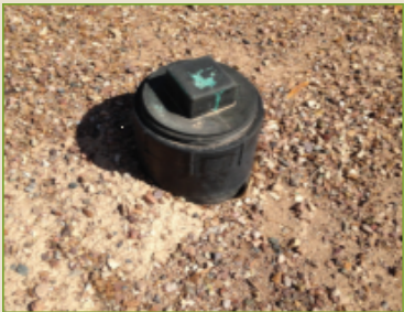
*Sanitary Sewer Cleanout Caps*