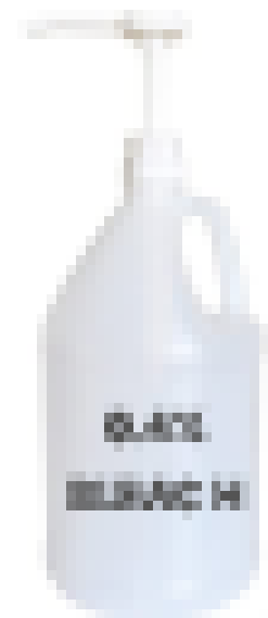
HARD SURFACE CLEANER